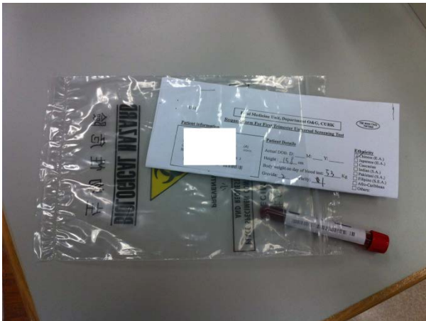
Fig.3 Place blood sample and the form in a specimen carrier bag.